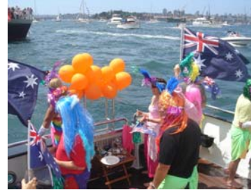
Australia Day on the Texas Lady