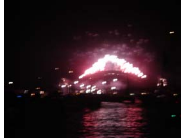
New Year, the Bridge with the coat hanger theme