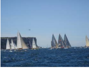
Sydney to Hobart Race. leaving the heads