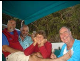
The Madbuggers a group of friends who have just purchased a new cruising boat and sailed it down from Queensland together